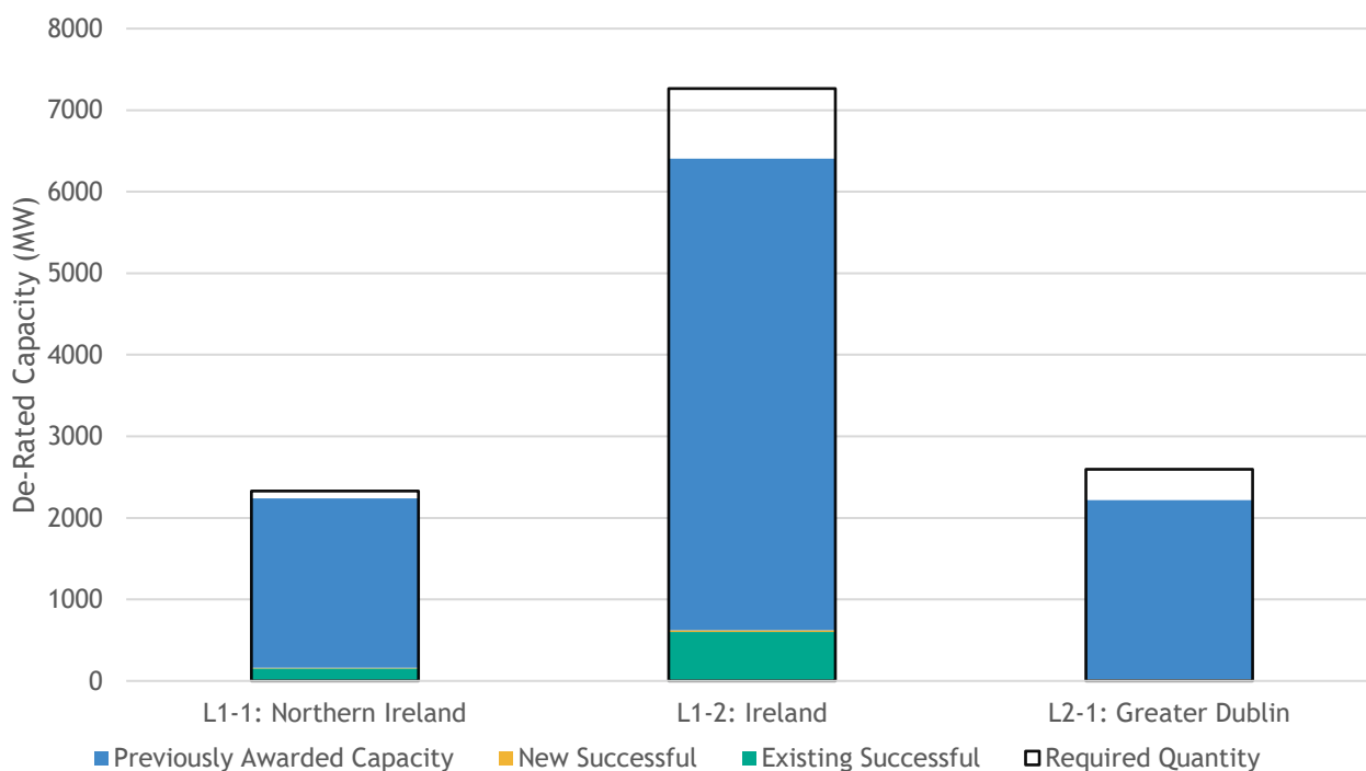
Figure 2 - Summary of auction by locational area

Figure 2 shows the auction outcome in terms of existing and new capacity for Northern Ireland, Ireland and Greater Dublin locational capacity constraint areas and also shows the auction required quantity for each locational area as well as Awarded Capacity from previous auctions.