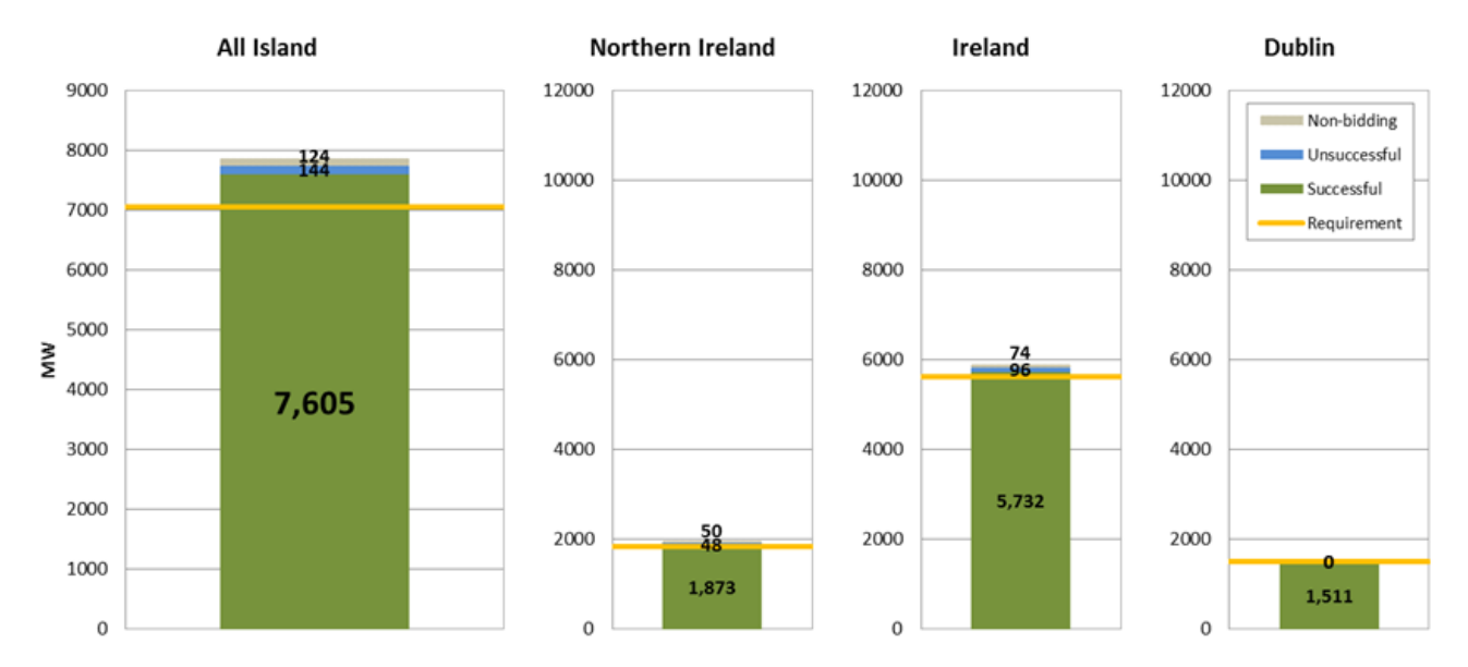
Figure 2: MW requirements and quantities successful, unsuccessful and non-bidding in the auction. The All Island values are the sum of the Northern Ireland and Ireland values. The Ireland values include Greater Dublin.

Figure 2 illustrates the quantity of de-rated capacity successful in the auction. It gives the all-island total and the breakdown for each locational capacity constraint area. It also shows the quantity that was unsuccessful and the quantity of qualified capacity that did not offer into the auction. The yellow horizontal lines indicate the minimum requirements in each area. All minimum MW requirements set in the auction were satisfied. Note that the requirements for this auction have been adjusted by the Regulatory Authorities.