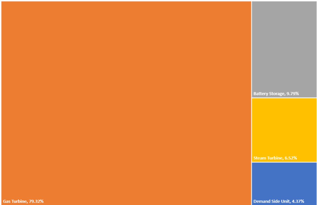
Figure 3: Illustrates the percentage of total de-rated capacity that each technology class was successful in the T-3 2024/2025 Capacity Auction. This just reflects the auction outcome in terms of de-rated MWs and does not indicate the final energy or installed capacity mix.

A total of 153 units were qualified to participate in the auction (51 units qualified with a qualified capacity greater than 0 MW), totaling 1838.909 MW of de-rated capacity. 41 units were either fully or partially successful and a total of 1471.095 MW of capacity awarded in the auction. Table 5 provides a breakdown of the quantity of successful de-rated capacity for each Technology Class in each Locational Constraint Area and the all-island total. It also provides the number of Capacity Market Units that were either fully or partially successful in each area.