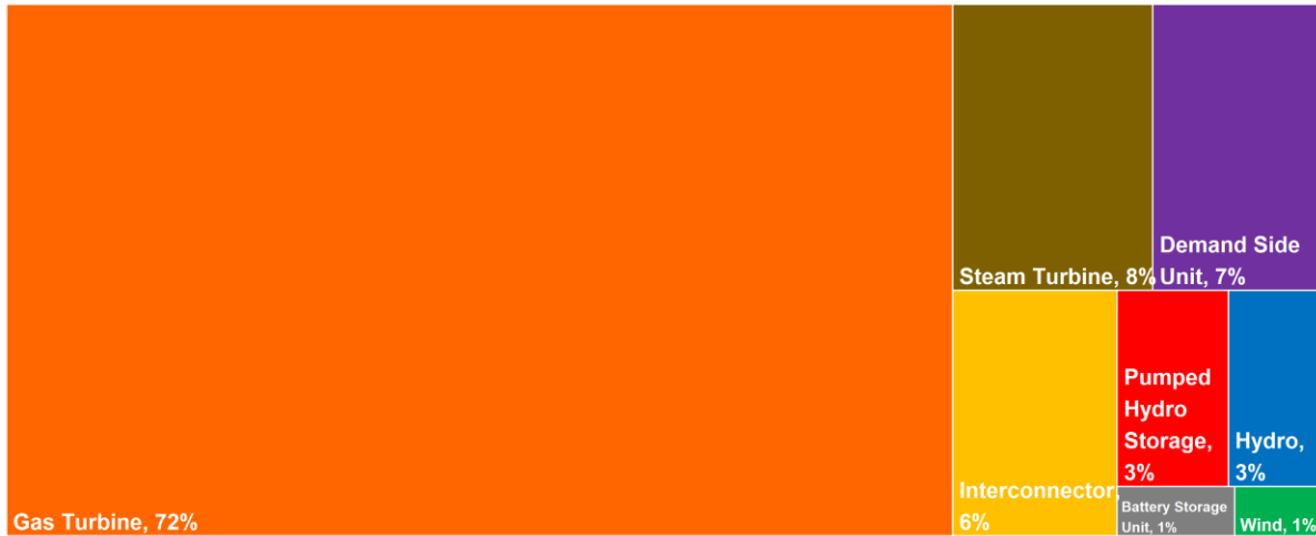
Figure 3: Illustrates the percentage of total de-rated capacity that each technology class was successful in the T-4 2023/2024 Capacity Auction. This just reflects the auction outcome in terms of de-rated MWs and does not indicate the final energy or installed capacity mix.

Figure 3 reflects the auction outcome in terms of de-rated MWs and does not indicate the final energy or installed capacity mix. It is important to note that the MW requirements set in the auction have been adjusted to take account of non-market generation and renewable generation that has not participated in the auction. To date, most renewable generation has not participated in the Capacity Auctions. Mechanisms like REFIT in Ireland and ROCs in Northern Ireland were specifically designed to encourage investment in renewable energy.