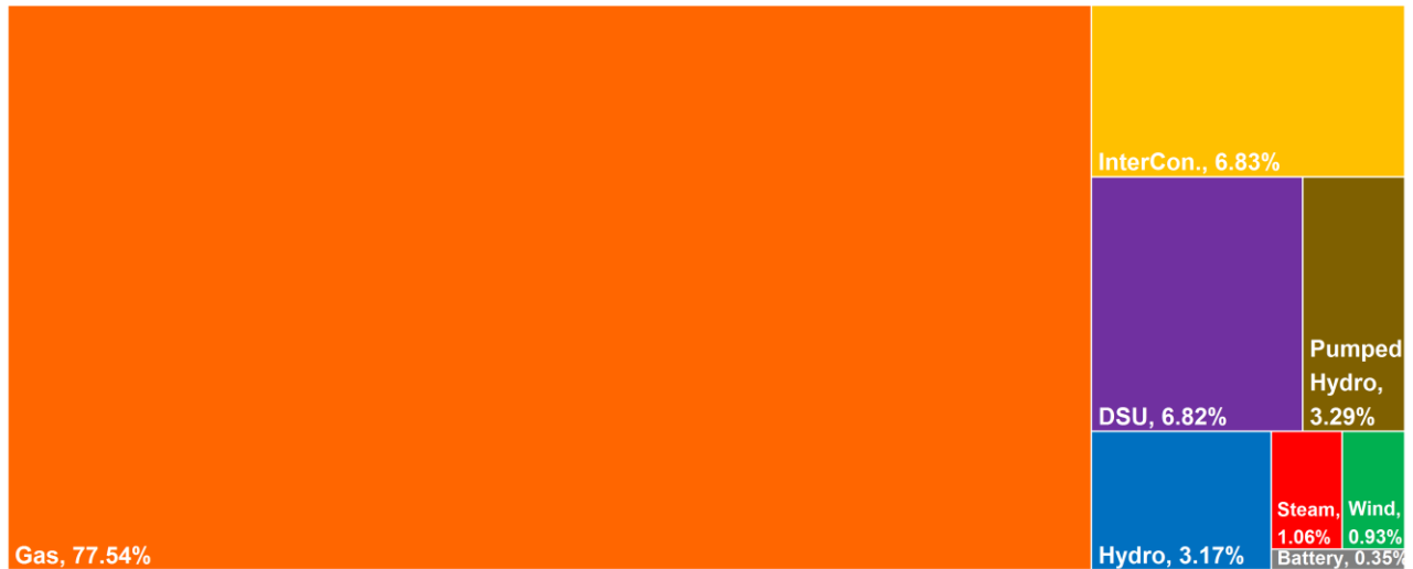
Figure 3: Illustrates the percentage of total de-rated capacity that each technology class was successful in the T-4 2024/2025 Capacity Auction. This just reflects the auction outcome in terms of de-rated MWs and does not indicate the final energy or installed capacity mix.

Figure 3 reflects the auction outcome in terms of de-rated MWs and does not indicate the final energy or installed capacity mix. It is important to note that the auction required quantities have been adjusted to take account of non-market generation and renewable generation that has not participated in the auction. To date, most renewable generation has not participated in the Capacity Auctions. Mechanisms like REFIT and more recently RESS in Ireland and ROCs in Northern Ireland were specifically designed to encourage investment in renewable energy.